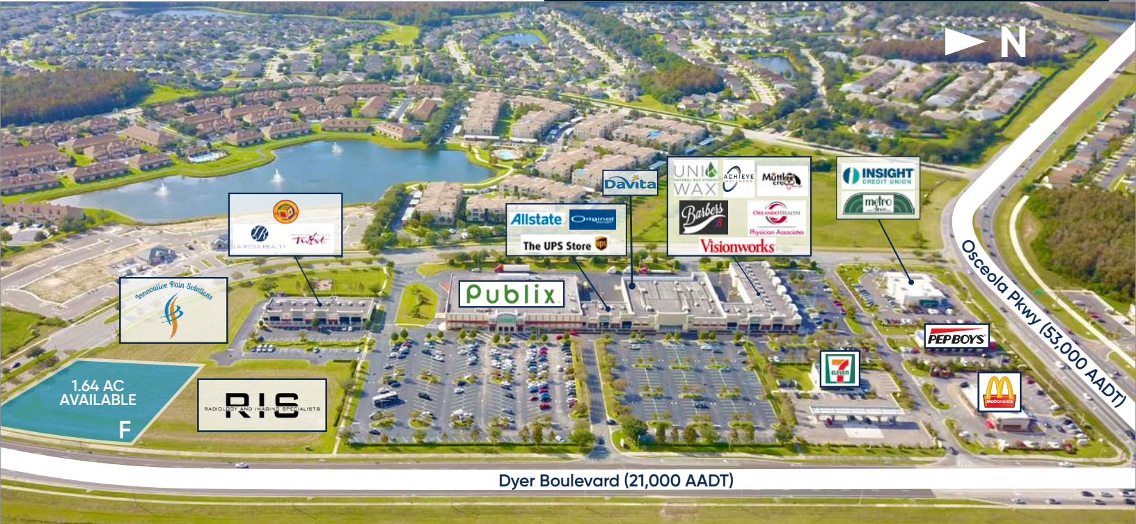
Dyer Boulevard (21,000 AADT)