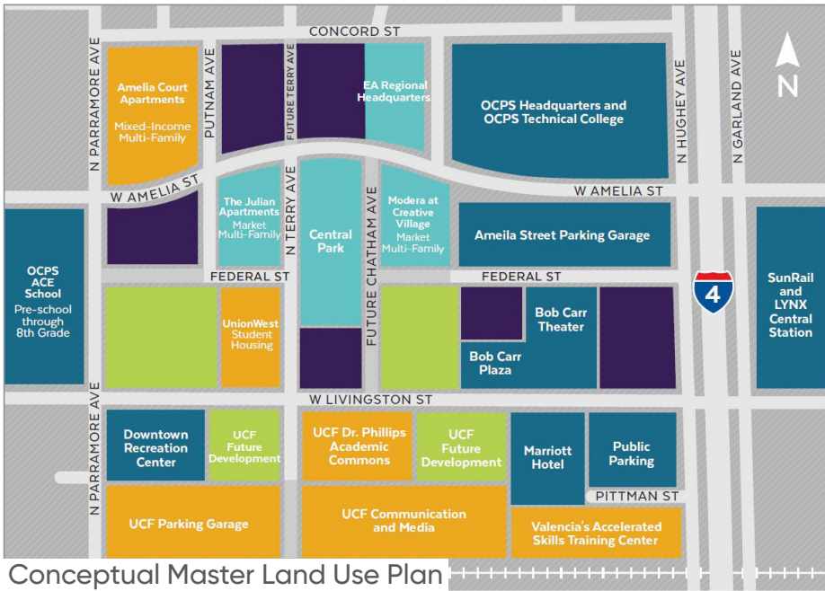
Conceptual Master Land Use Plan